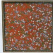
Forest painting, $42 at Haymaker Shop