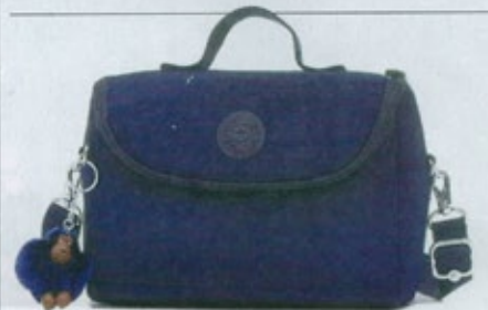
Kipling New lunch bag, $48 at kipling-usa.com