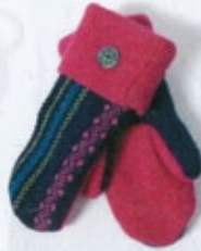
Recycle Girl adult mittens, $45 at Green Genes