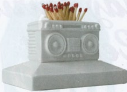
Boom box match strike, $42 at Jonathan Adler