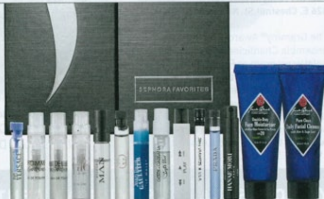
Sephora deluxe fragrance samples, $50 at Sephora

Since scents smell different on each person's skin, picking one out as a gift is dang near impossible. Opt for this kit for men and women, which includes a gift card for a full-size bottle of the recipient's choice.