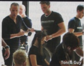
Toni & Guy

14 years ago after completing design school at the Fashion Institute of Technology. He began his career as a model and was an apprentice to Gianni Versace before launching his own shoe line in 2001. He travels to New York City often, but Milan remains the headquarters of his growing brand. —Marni Golden