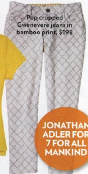
Pop cropped Gwenevere jeans in bamboo print, $198