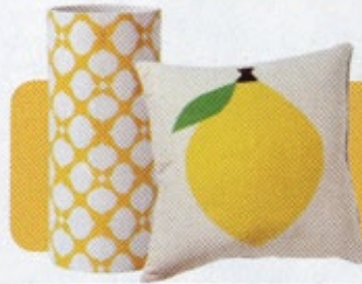
FOR THE HOME Jonathan Adler Carnaby Hollywood vase (left), $48, and Lemon pillow, $178; jonathanadler.com

$1.00 turns craveable into irresistible.