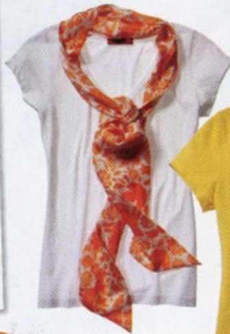
Rustic tee with Acapulco print silk scarf, $135