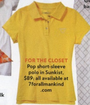
FOR THE CLOSET Pop short-sleeve polo in Sunkist, $89; all available at 7forallmankind.com