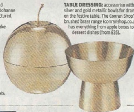
TABLE DRESSING: accessorise with silver and gold metallic bowls for drama on the festive table. The Conran Shop's brushed brass range ( conranshop.co.uk ) has everything from apple boxes to dessert dishes (from £35).

BAUBLES: high-end baubles and decorations from Georg Jensen (Johanne Heart Christmas Decoration, pictured, £30) and Vera Wang (Wedgwood Snowflake Relief Bauble, £25), are bestsellers at John Lewis this year. But you can create a similarly luxurious look for less with the John Lewis Diamanté Wreath Tree Decoration (£3) and the John Lewis Crackle Bauble in Cream (£3.50). Find out more at johnlewis.com