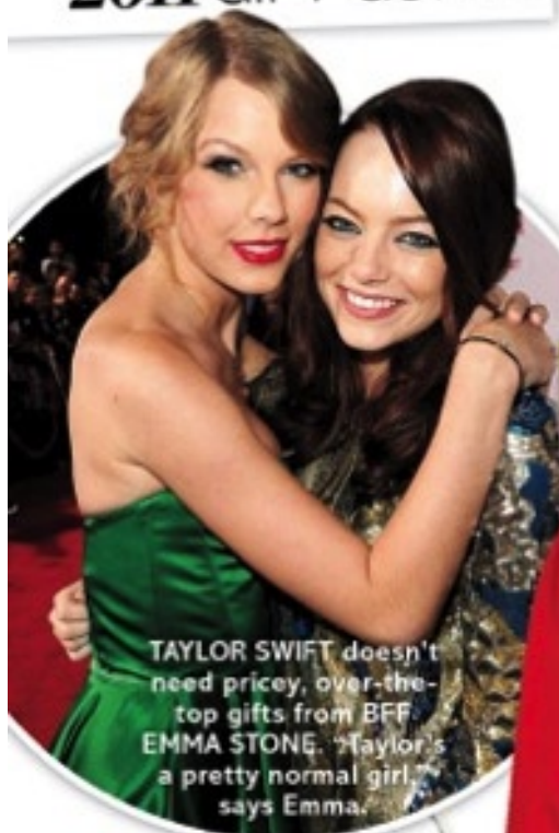
TAYLOR SWIFT doesn't need pricey, over-the-top gifts from BFF EMMA STONE. "Taylor's a pretty normal girl," says Emma.