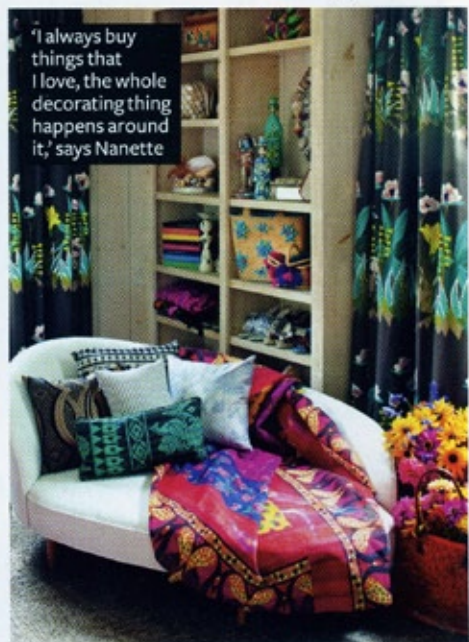
"I always buy things that I love, the whole decorating thing happens around it," says Nanette