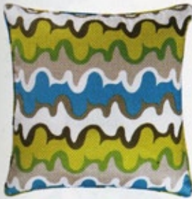
Sooki Teal 18-in. Pillow. $25. Visit crateandbarrel.com

Teal is unique in that it is smack-dab in the middle of the visible colour spectrum—sandwiched between three “cool” calming colours and three “warm” stimulating colours. Teal brings good balance and harmony, which in my mind makes it a perfect colour to stabilize your living space.