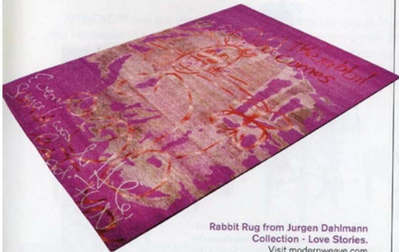
Rabbit Rug from Jurgen Dahlmann Collection - Love Stories. Visit modernweave.com

Only seating this comfortable can get away with a name like Fatboy. Its easy to clean coating and flat (read, fat) construction puts to shame the "beanbag" from years past and comes in many trendy colours to suit your room.