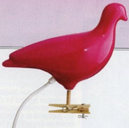
Pigeon Light by Ed Carpenter $99. Through Generate Design. Visit gnr8.biz/