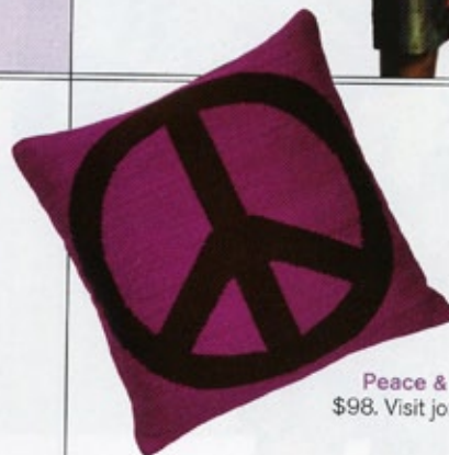
Peace & Love Pillow. $98. Visit jonathanadler.com