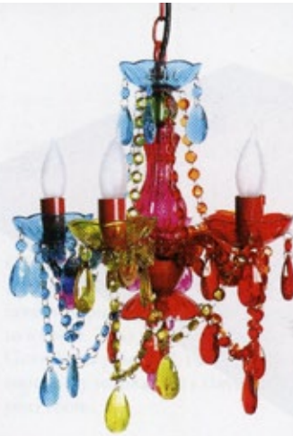
The vagabond of chandeliers – its tri-colour scheme is a departure from the usual, but it will never get lost in its travels from chic to cool.

Gypsy Chandelier - Small. $78. Visit urbanoutfitters.com