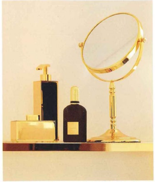
GOLDEN WONDER Left 'Bamboo' silk curtains, £807 for a pair, The Natural Curtain Company ( naturalcurtaincompany.co.uk ). 'Ottoline' brass-plated table by DOM Edizioni, £2,950, Cue Agents ( cueagents.com ). 'Montana' brass table light, £641; 'Warwick' paper lamp shade, £77, both Vaughan ( vaughandesigns.com ). 'Retro Aviator' headphones by Skullcandy, £150, Urban Outfitters ( urbanoutfitters.co.uk ). Hermès box, stylist's own Right Brass trolley, £1,600; brass container, £289; soap dispenser, £329, all Zodiac ( zodiac-london.co.uk ). 'Extreme' esu de toilette, £80, Tom Ford ( tomford.com ). Double-sided pedestal mirror, £39, John Lewis ( johnlewis.com )