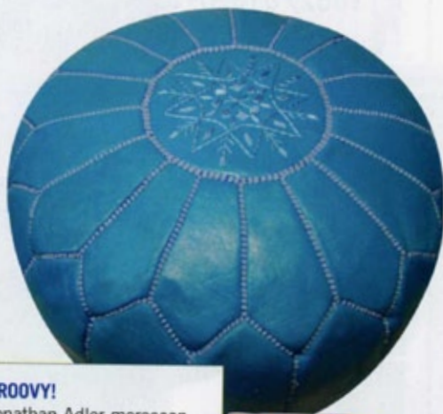
GROOVY! Jonathan Adler moroccan pouf in turquoise and coffee mugs, Summerhouse