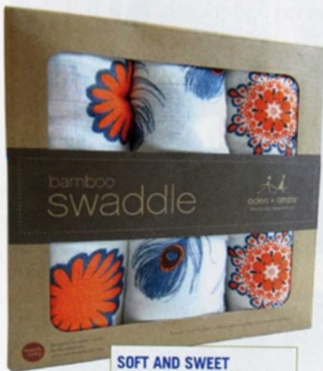
SOFT AND SWEET Bamboo Swaddle by aden + amis, Cosmo Tot