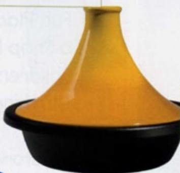
SPICE OF LIFE Le Creuset Tagine, lecreuset.com