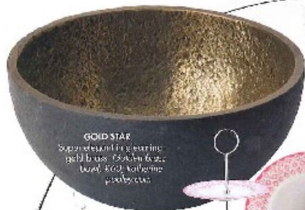
GOLD STAR Super elegant in gleaming gold finish. Golden base, lined, £60. Katherine perfect.com

► COLOUR SHOCK Home stitch pattern in ziggy brights. Bergamo Woad. Avonue pillow, £175. jonathanadler.com