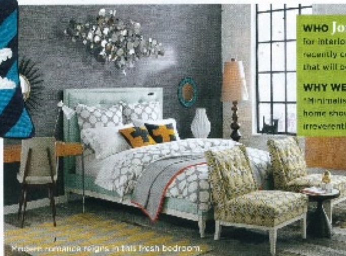
Modern romance reigns in this fresh bedroom.

WHO Jonathan Adler , potter with a penchant for interior design, author and television personality, who recently collaborated with Lacoste on a special collection that will be available mid-November 2011.