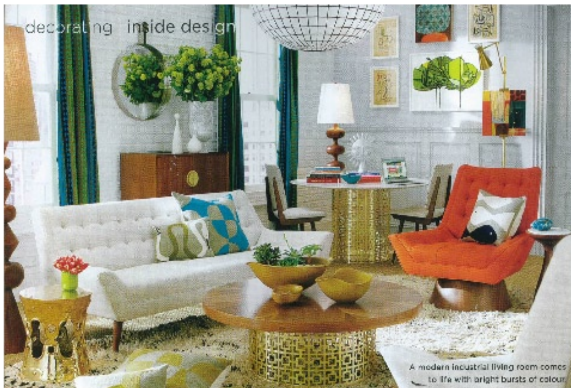
A modern industrial living room comes to life with bright bursts of colour.