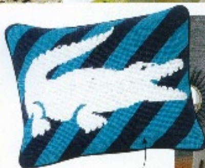
Jonathan Adler for Lacoste Buy one of his Limited-edition polo shirts, and it comes in a crazy case like this!