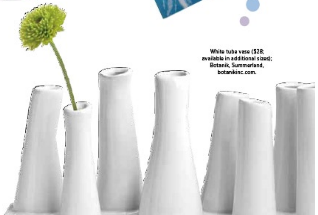
White tube vase ($28; available in additional sizes); Botanik, Summerland, botanikinc.com .