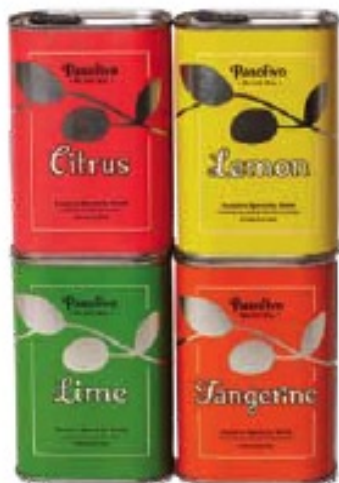
Pasaivo assorted olive oils ($25 each); We Olive, Ventura, weolive.com ; C'est Cheese, Santa Barbara, cestcheese.com ; or pasaivo.com .