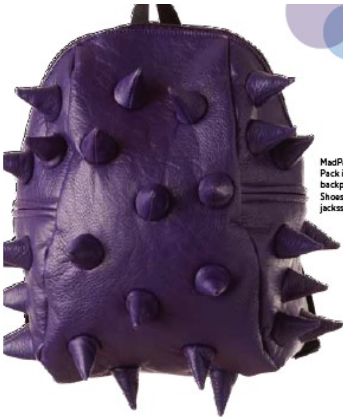
MadPax "Spiketus Rex Half Pack in Purple People Eater" backpack ($46); Jack's Shoes, Westlake Village, jacksshoesofwestlake.com .